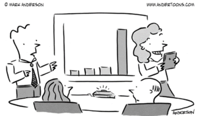
"Before we move on, does anyone else want to take a selfie with the fourth quarter earnings?"

What's more, the approach "If it ain't broke, don't fix it" very likely leaves huge holes in your security and drastically magnifies the costs of an IT meltdown. If they're only arriving in the midst of crisis, there's hardly ever an opportunity for the break-fix technician to strengthen the barriers between you and the hordes of hackers